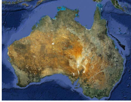
Figure 3 Beach infrared remote sensing image

30 kinds of infrared remote sensing images from farmland, forest and beach were selected to form redundant dictionary, 30 pieces were used for training purposes, and the remaining 40 images were selected for testing according to the randomness principle. Then, the training and test images are respectively represented in the redundant dictionary in the sparse form, and then the sparse representation feature vector of the infrared remote sensing image is obtained, and input into the classifier for classification.